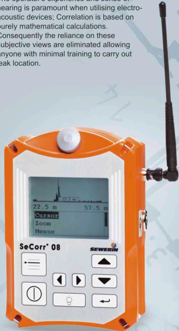
Receiver SeCorr ® 08

The operator's experience and sense of hearing is paramount when utilising electro-acoustic devices; Correlation is based on purely mathematical calculations. Consequently the reliance on these subjective views are eliminated allowing anyone with minimal training to carry out leak location.